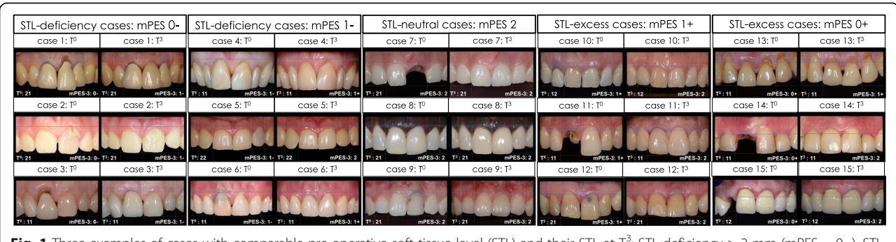
Fig. 1 Three examples of cases with comparable pre-operative soft tissue level (STL) and their STL at T^3 ; STL-deficiency > 2 mm (mPES = 0–), STL-deficiency 1–2 mm (mPES = 1–), STL-neutral (mPES = 2), STL-excess (mPES = 1+), and STL-excess (mPES = 0+)

In cases with a pre-operative excess of soft tissue comparing to the contra-lateral incisor, reduction of soft tissue height is required. In 15 cases, the desired STL reduction was reached to level up with the contra-lateral